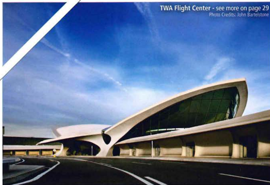
TWA Flight Center - see more on page 29