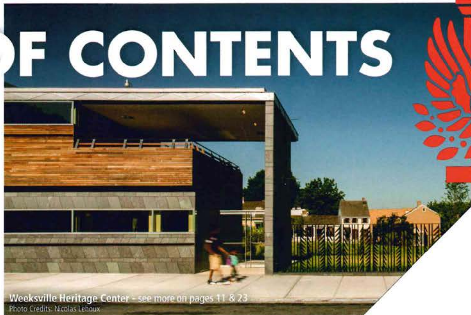
Weeksville Heritage Center - see more on pages 11 & 23